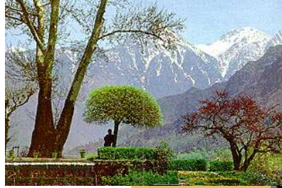
Kashmir has been often described as the "the one paradise on earth"