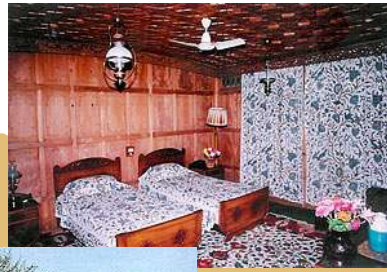
Stay in complete comfort on houseboats!