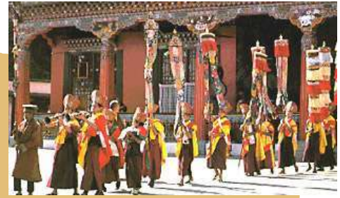
Buddhist Monastery in Sikkim