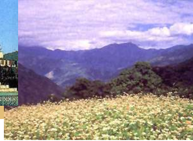
Orchids, breathtaking mountains and much more....